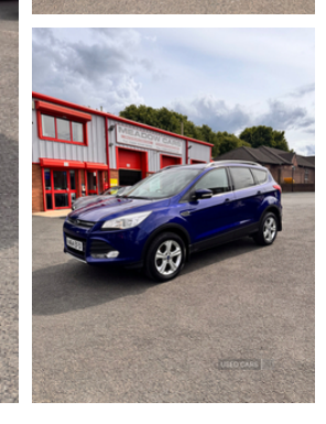
just arrived, being prepared, 4wd, fsh, new timing belt fitted